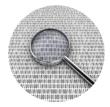
Task 3: Instructional Methodology to Support High Achievement of All Students

Accreditation Faction #8: The staff applies research based knowledge about teaching and learning in the instruction process. Assessment is frequent and varied, integrated into the teaching/learning process, and informs curriculum planning.