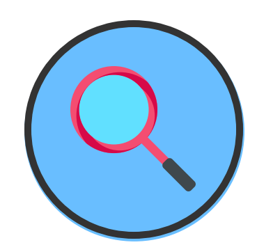
Leading Accreditation InDepth Study