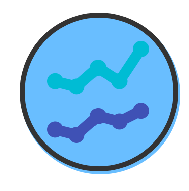
Using MAP Data